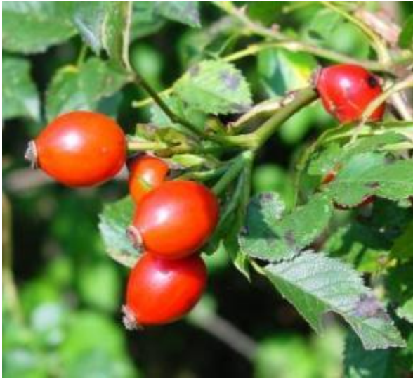
Dog Rose ( Rosa canina )