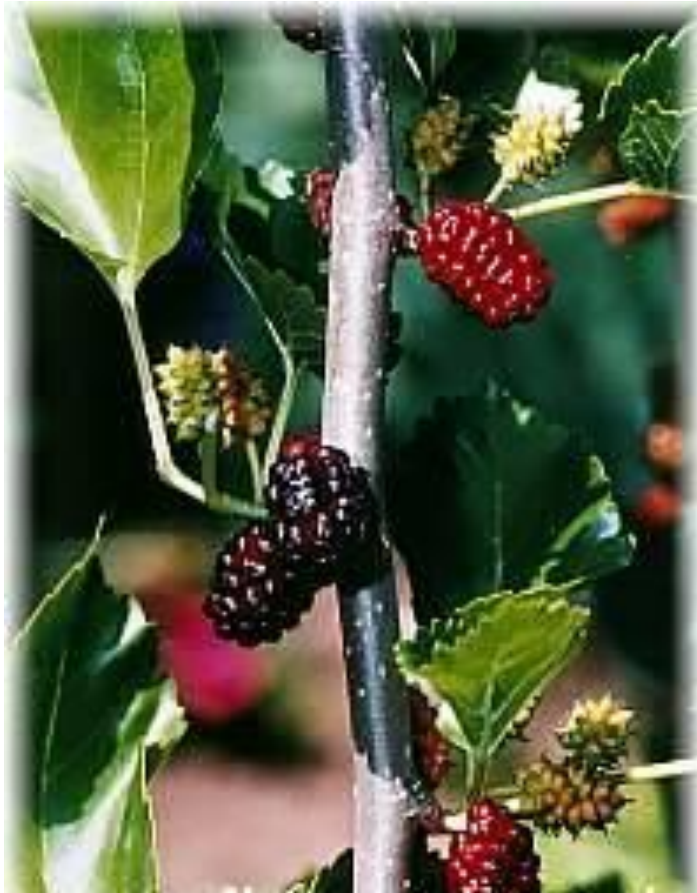
Black Mulberry ( Morus nigra )