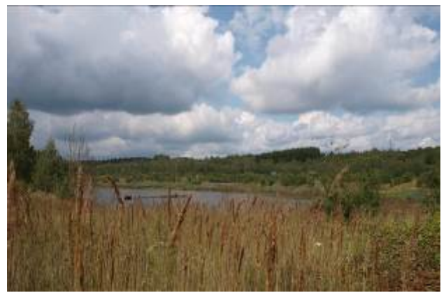
Fig. 4 The post-mining landscape under an ecological succession, Helena Lincová, 2014

A similar situation is repeating in this case. In the field of the formal values The Svratecká Hornatina Natural Park covers the east part of The Rožná Village area. On the contrary, an ecological succession (Fig.4) is under way in many places in the post-mining landscape.