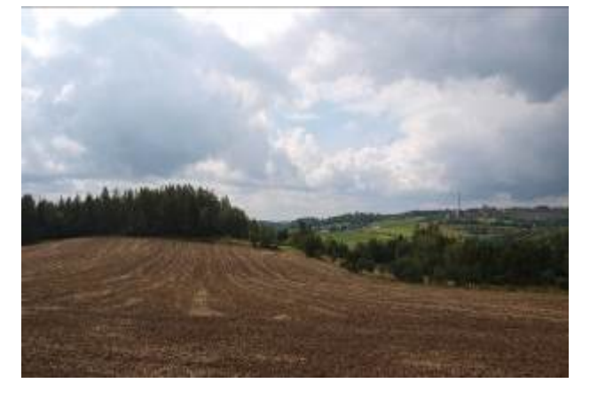
Fig. 1 The Hradisko Hill with a closed uranium mine on the horizon, Helena Lincová, 2014

A rural countryside of the Rožná Village contains three different types of cultural values. Firstly, there is St. Havel Church with adjoining graveyard from 14<sup>th</sup> century. Secondly, the Hradisko Hill (Fig.1), a mysterious landmark situated on the right bank of the Nedvědička stream, which is closely attached to old building area. Hradisko is also a mineral deposit of lepidolit. Finally, there are two closed uranium mine.