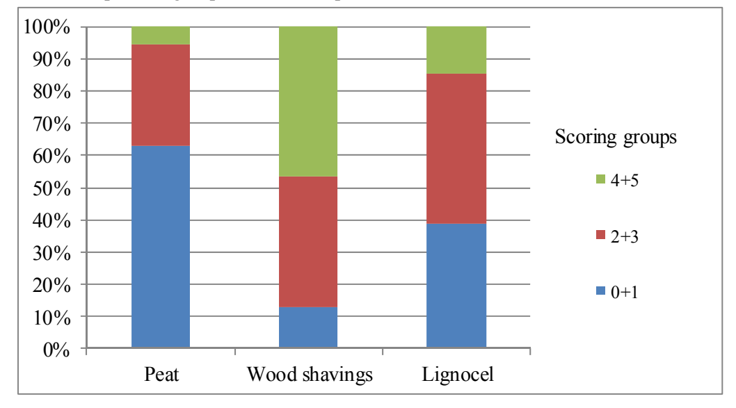
Fig. 2 Classification of paws in groups in second experiment