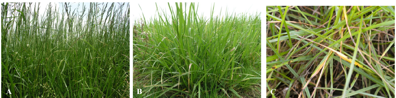
Figure 1. (A) Festulolium pabulare vegetation before the first cutting. (B) Leaf shoots of Festulolium pabulare before the second cutting in untreated plants. (C) Puccinia sp. on leaves of Lolium perenne .

In the spring of 2011, there was widespread infection of grasses by Fusarium nivale . Additionally, many plants experienced multiple infections by Colletotrichum graminicola , F. pabulare and Ascochyta . In late summer and autumn, Puccinia graminis and Puccinia coronata occurred on all experimental species (Figure 1C). To a lesser extent, Blumeria graminis was also detected. Such other fungi as Alternaria spp., Cochliobolus spp., Aspergillus niger , and Ramularia spp. also were observed, but their occurrence was negligible as compared to the aforementioned species. Fungal diseases altered forage production (volume) and quality due to the fact that grasses actively defend themselves against the presence of a pathogen. There are two main types of defense pathways: (i) mechanical, and (ii) biochemical. Mechanical defense is based on an increase in the content of solid fibrous elements,